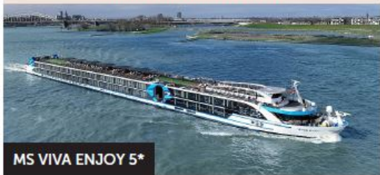
MS VIVA ENJOY 5*

To learn more about the ship, visit http://ittworld.com/viva-enjoy